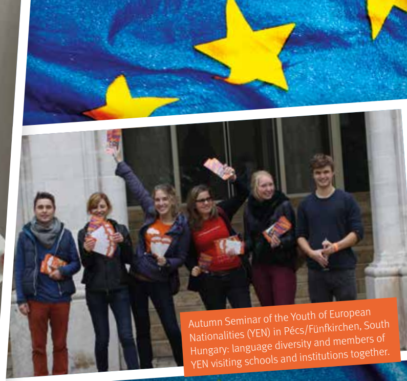
Autumn Seminar of the Youth of European Nationalities (YEN) in Pécs/Fünfkirchen, South Hungary: language diversity and members of YEN visiting schools and institutions together.