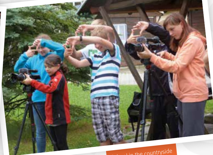
School in the countryside

It's never too late ... Learn more languages!