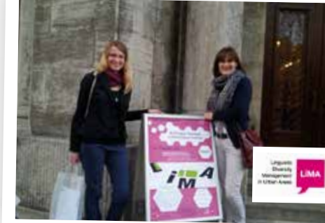
LIMA Final Conference 2013: Multilingual Individuals and Multilingual Societies in Hamburg: Discussion with linguists.