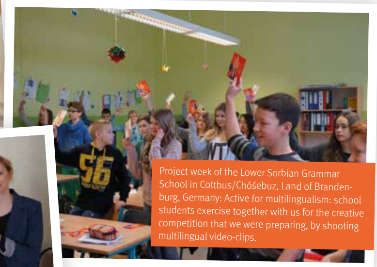
Project week of the Lower Sorbian Grammar School in Cottbus/Chóšebuz, Land of Brandenburg, Germany: Active for multilingualism: school students exercise together with us for the creative competition that we were preparing, by shooting multilingual video-clips.