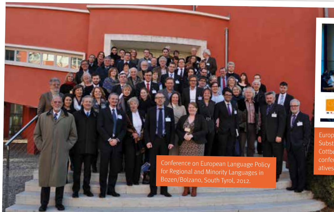
Conference on European Language Policy for Regional and Minority Languages in Bozen/Bolzano, South Tyrol, 2012.