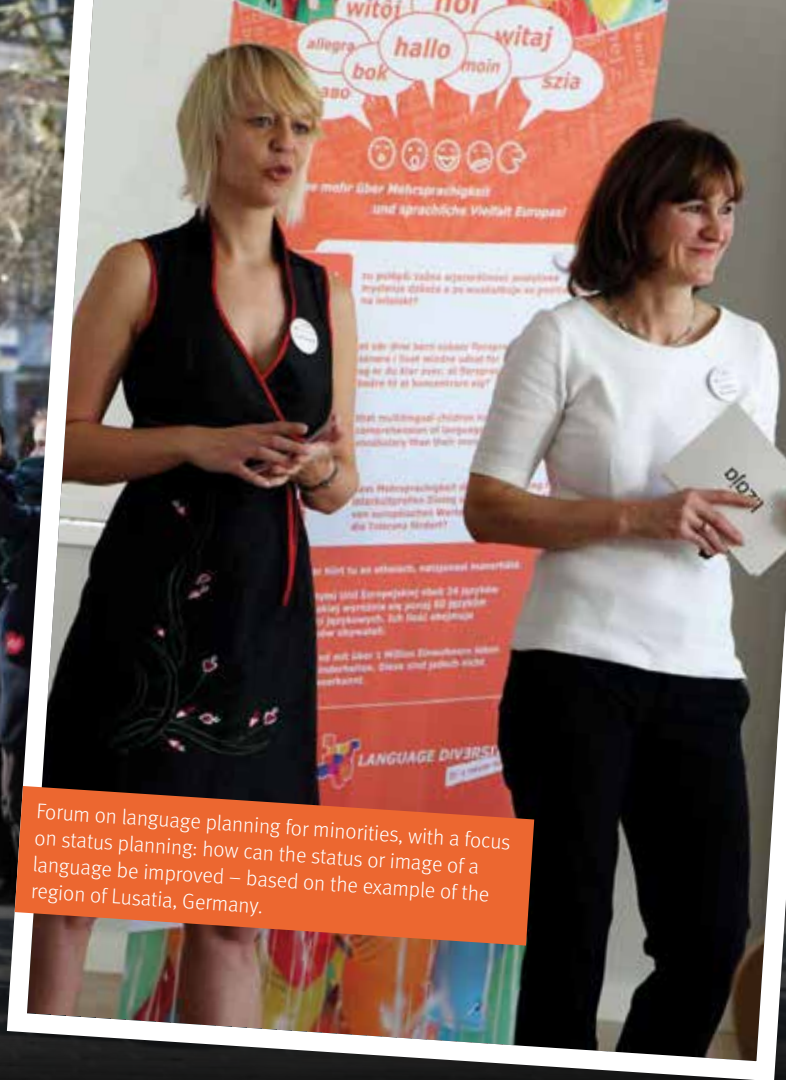
Forum on language planning for minorities, with a focus on status planning: how can the status or image of a language be improved – based on the example of the region of Lusatia, Germany.