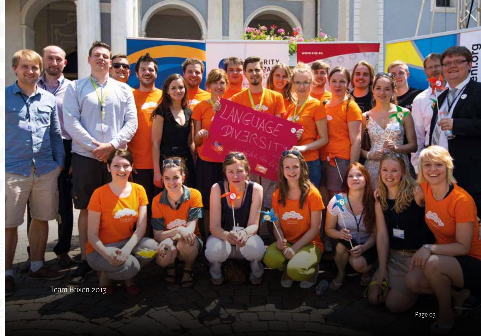
Team Brixen 2013

This project has been funded with support from the European Commission. This publication reflects the views only of the author, and the Commission cannot be held responsible for any use which may be made of the information contained therein.