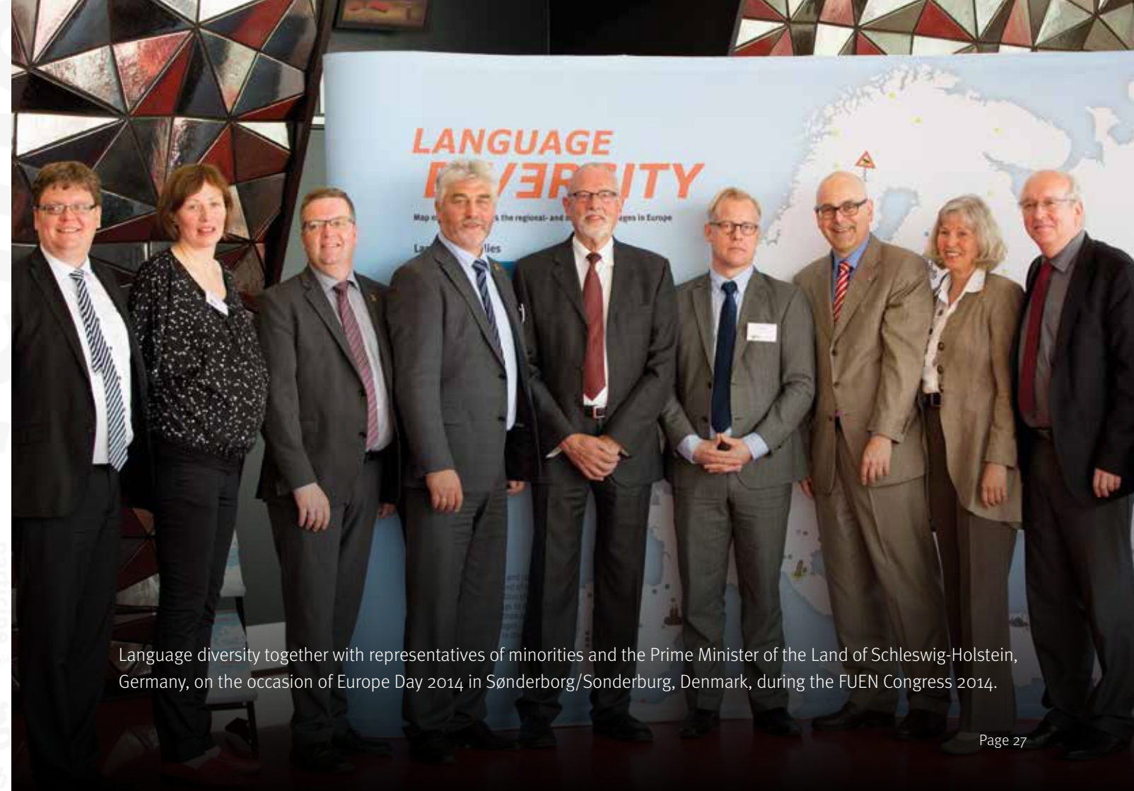
Language diversity together with representatives of minorities and the Prime Minister of the Land of Schleswig-Holstein, Germany, on the occasion of Europe Day 2014 in Sønderborg/Sonderburg, Denmark, during the FUEN Congress 2014.