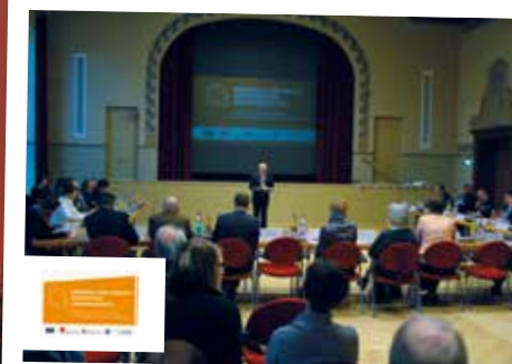
European Conference on Language Policy: Substance and Practice of European Language Rights Cottbus/Chóšebuz, Lusatia, in December 2013: conference with scientists, politicians and representatives of minorities.