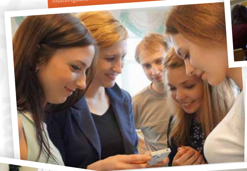
Seminar for teams of educators at the ethno-cultural language camp of the Germans in Russia in Udelnaja/Moscow District, Russia: educators learn together with our team how by using creative ideas they can teach their students about multilingualism and linguistic diversity.