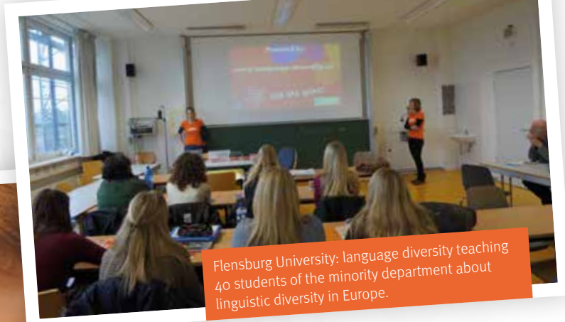
Flensburg University: language diversity teaching 40 students of the minority department about linguistic diversity in Europe.