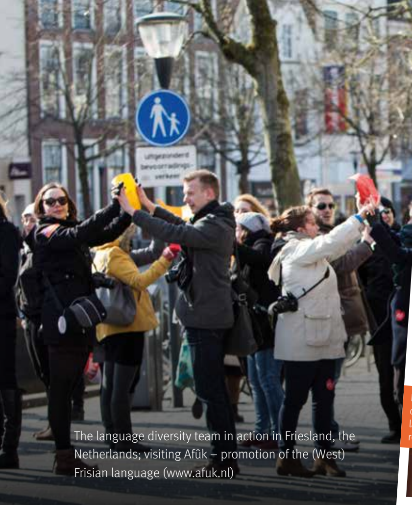
The language diversity team in action in Friesland, the Netherlands; visiting Afûk – promotion of the (West) Frisian language ( www.afuk.nl )