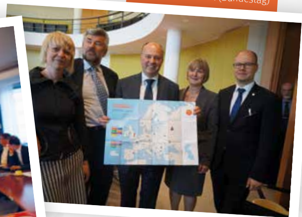
German Parliament (Bundestag)