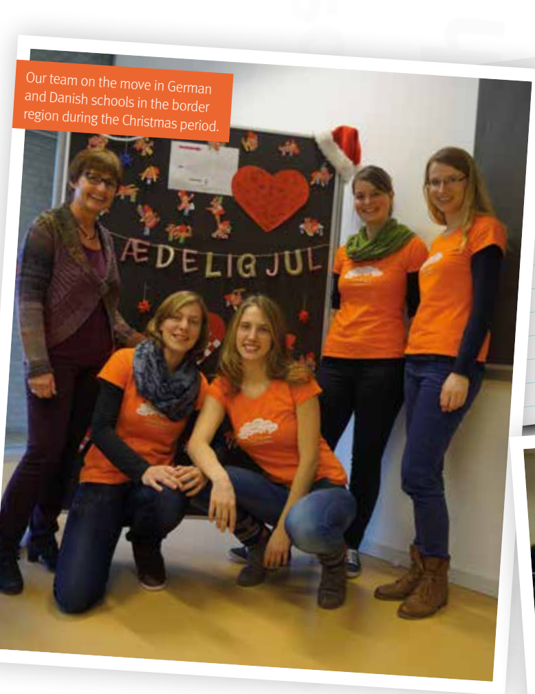
Our team on the move in German and Danish schools in the border region during the Christmas period.